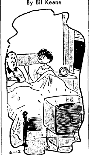
"During the next commercial I'll take care of that prowler downstairs."